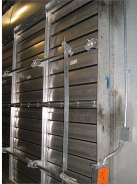
Figure 3. Are those return air dampers completely closed? The answer in this case: no. There’s a slight gap, which lets a lot of air through and reduces the efficiency of the system.