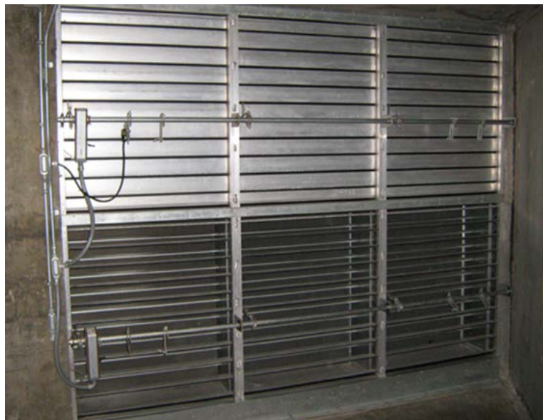
Figure 2. Control can be challenging to non-existent if the actuator isn't tight to the linkage. The top set of outside air dampers should be open, based on the command signal.