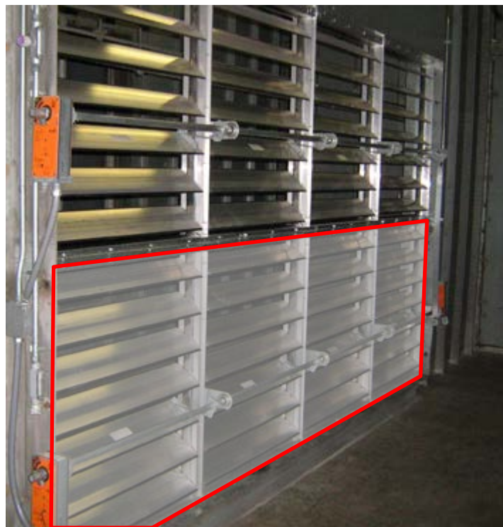
Figure 1. Return air dampers too big? Blanking them off may improve performance.